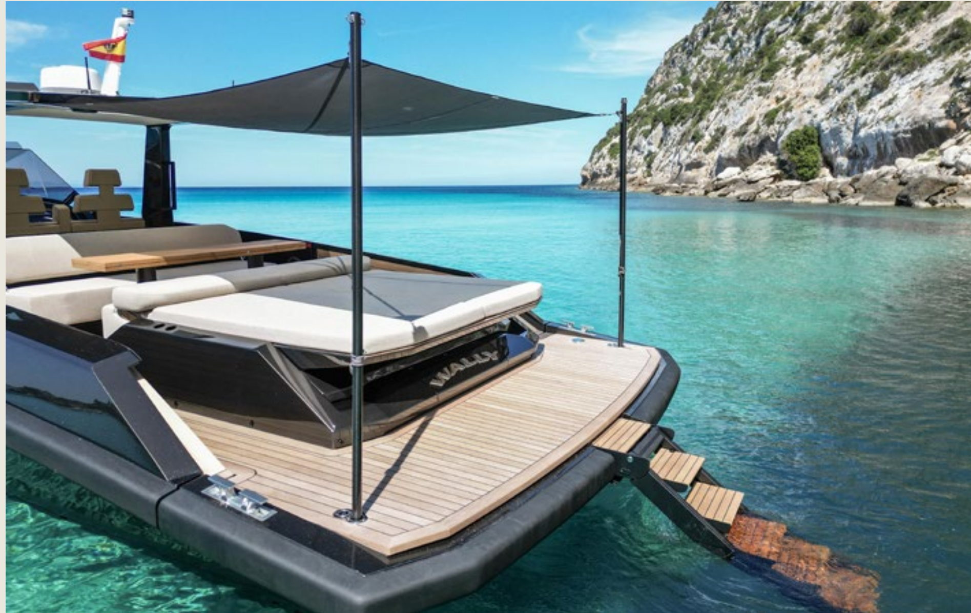
W A L L Y 4 8