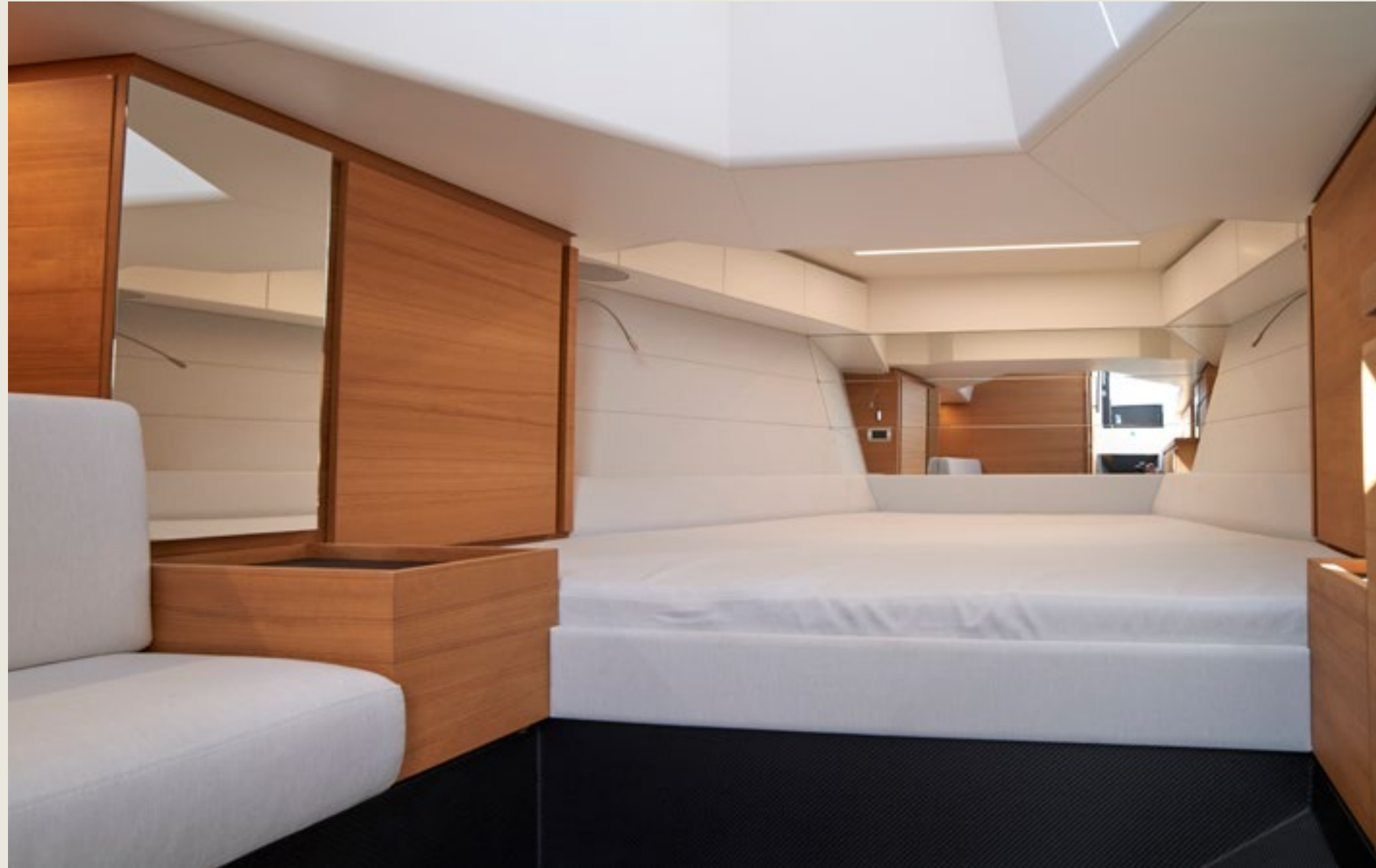
W A L L Y 4 8